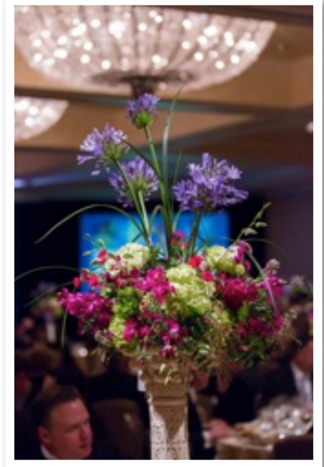
Check out the flowers and decor at the Four Seasons!