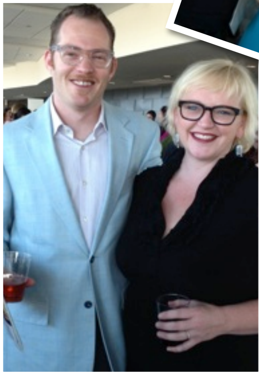
Cast and crew celebrated the end of the season at the Guild-sponsored fete following the final performance of Faust.